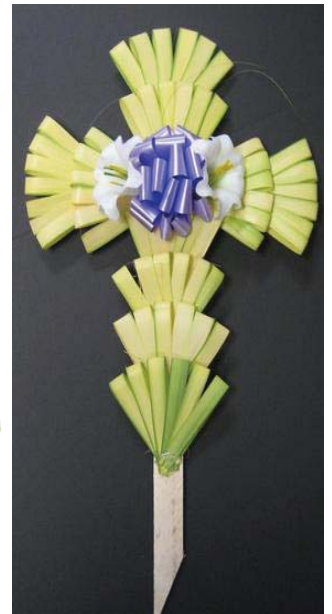
PALM CROSS (decorative)