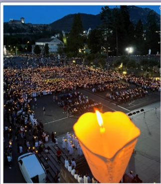
Esplanade lit up with candles

We made so many memories and created relationships with people all around the world that will last a lifetime.