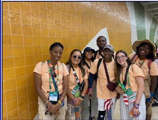
Director with Senior & Graduate Scholars @ Retreat