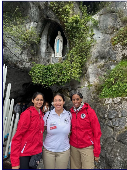
Director with Scholars at the Grotto in Lourdes, France (above) & Director with World Youth Day Scholar Pilgrims in Portugal (below)