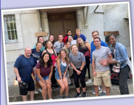
Group after mass on final day

We also got the chance to be on the receiving end of all that Lourdes had to offer. We took a bath in the Lourdes water performing the four gestures that were outlined by Mother Mary. On our last day, we started the day at the Stations of the Cross admiring the Carrara marble. Later that night, we participated in the Rosary Procession singing “Ave Maria” with fellow stage and visitors. Finally, we revealed our prayer partners, a person we chose on our first night to pray for throughout the week. As Saint Mother Teresa once said, “I alone cannot change the world, but I can cast a stone across waters to create many ripples.” Our gestures of love don’t have to be extravagant. The little acts done out of love speaks volumes and can result in domino effects, touching the lives of those around us.