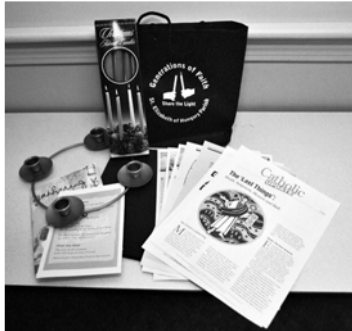
Church Year Example: Advent Home Kit