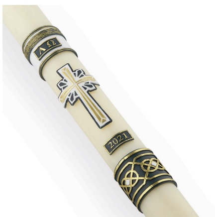
#70 Eternal Covenant