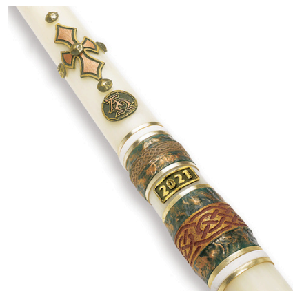
#37 Wonder Counselor

• Other options include the Divine Light candle and the Radiant Light collection