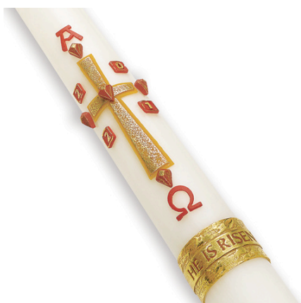
#50R He is Risen