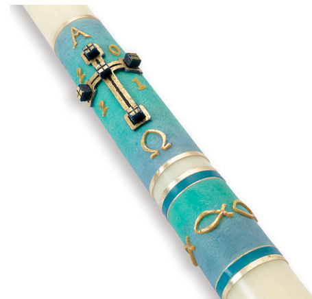
#67 The Great Commission