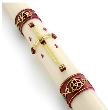
#66B Light Of The World