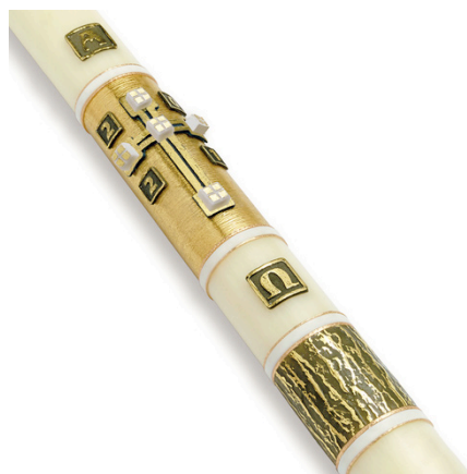
#61 Christus Vincit