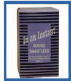
In an Instant