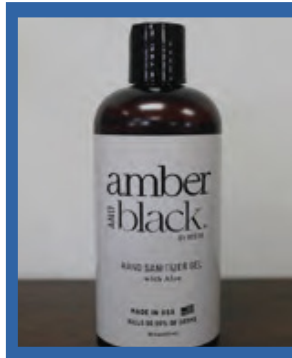
amber and black