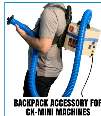
BACKPACK ACCESSORY FOR CK-MINI MACHINES

Pandemic Solutions LLC (PS) - ICS has partnered with PS because the company specializes in VSEs that are designed to allow a single individual to apply (spray) a disinfecting mist from a distance ranging from four feet to fifty feet from the point of 'spray.' The disinfectant can be applied very quickly, in fact in just 60 seconds, these VSEs can disinfect targeted areas ranging from 400 square feet to as much as 10,000 square feet.