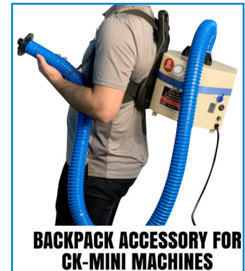
BACKPACK ACCESSORY FOR CK-MINI MACHINES

Pandemic Solutions LLC (PS) - ICS has partnered with PS because the company specializes in VSEs that are designed to allow a single individual to apply (spray) a disinfecting mist from a distance ranging from four feet to fifty feet from the point of 'spray.' The disinfectant can be applied very quickly, in fact in just 60 seconds, these VSEs can disinfect targeted areas ranging from 400 square feet to as much as 10,000 square feet.