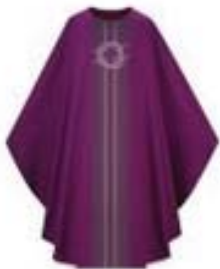
APPAREL & VESTMENTS