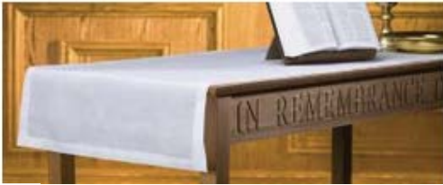
ALTAR CLOTHS & LINENS