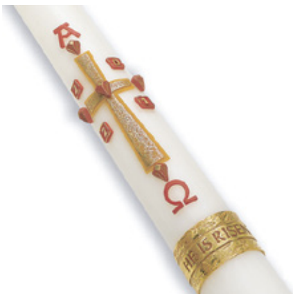
#50R He is Risen