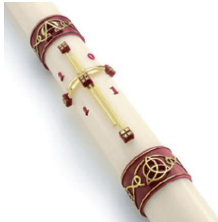
#66B Light Of The World