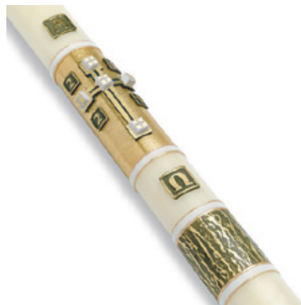
#61 Christus Vincit