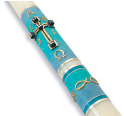
#67 The Great Commission