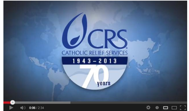
Catholic Relief Services: 70 Years in a Heartbeat